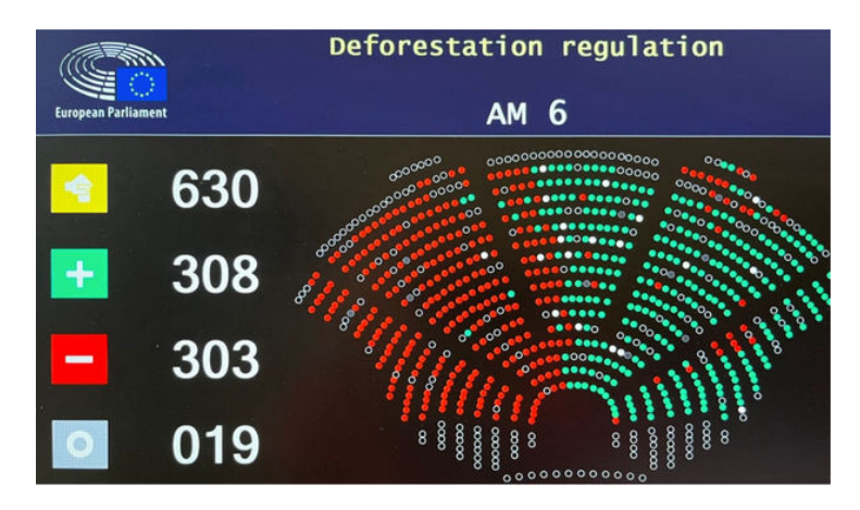
Vote on an amendment to the directive on imported deforestation

It is also noteworthy that the votes on imported deforestation were the result of negotiations between the EPP and the ECR, which did not involve the representatives of the PFE and ESN groups, who were reduced to the role of auxiliaries, in this case decisive (see example in Chart 2). It is the advent of regular, structured discussions between these 4 groups that would be likely to forge a genuine union of right-wing parties. At this stage, it appears that EPP group chairman Manfred Weber has mainly sought to render less theoretical his possibility of evading his traditional negotiations with S&D and Renew, by means of essentially tactical warning shots aimed at strengthening his influence vis-à-vis his traditional partners rather than initiating an alternative political strategy.