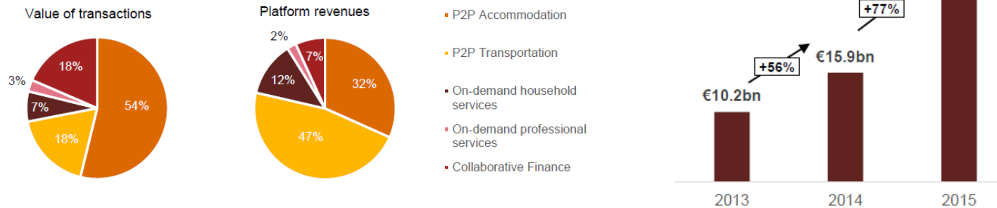
Figure 2: Revenues and transaction values facilitated by collaborative economy platforms in Europe (% of total, 2015)

€28 billion in total transactions in 2015, €3.6 billion in platform revenue